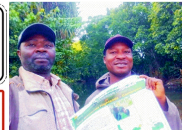
CIRMAD Coordinator and Field Liaison in Ako-Mbembe F/R