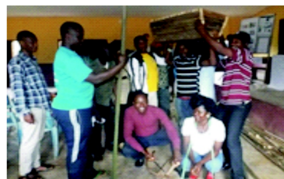
Trainees display constructed bamboo KTBH