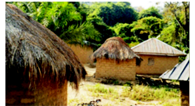
Ndaka - Living next door to Nature!