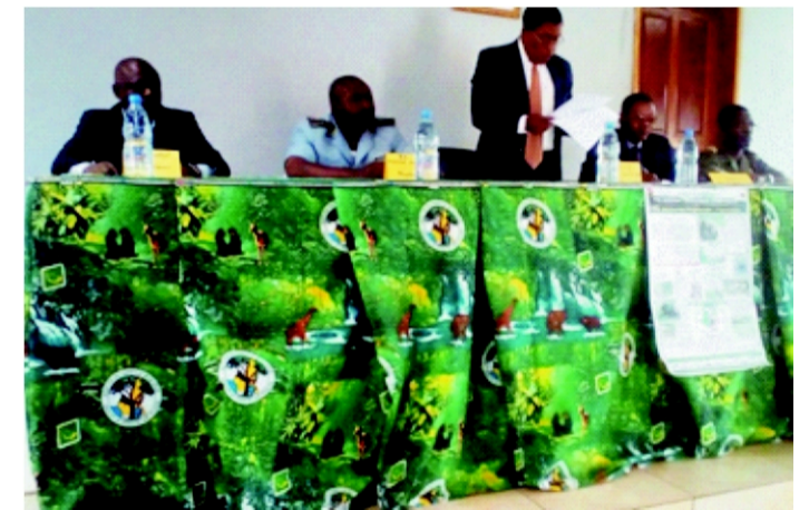
Regional Anti-poaching Committee - North West Region