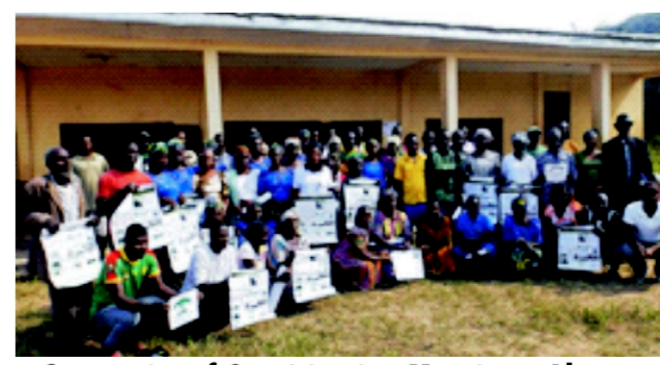
Group pics of Sensitisation Meeting - Ako town