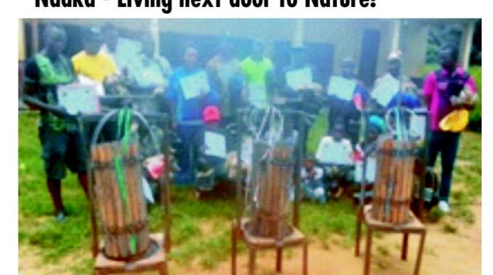
Cross section of participants with CIRMAD donated honey prees