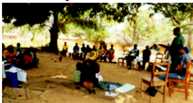
Ako Forestry Officer in CIRMAD organised sensitisation meeting - Buku village