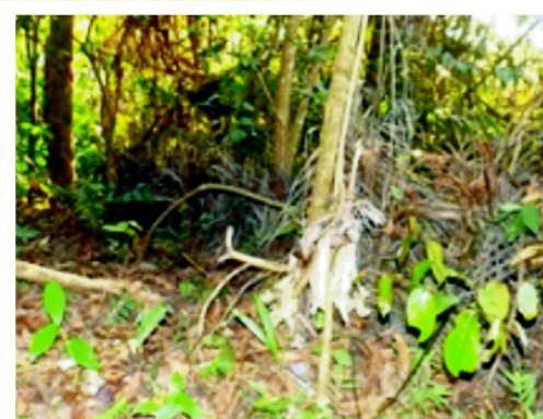
Fence trap in Ako-Mbembe Reserve