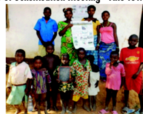
Conservation enthusiasts - Abafum village