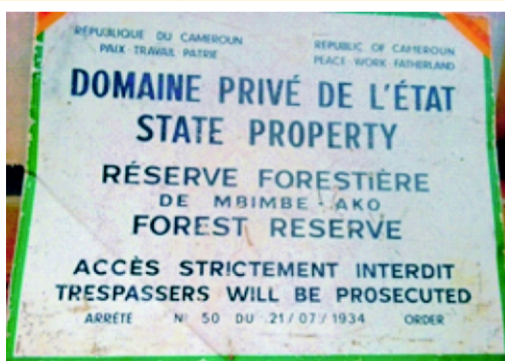
Official signboard of the Forest Reserve